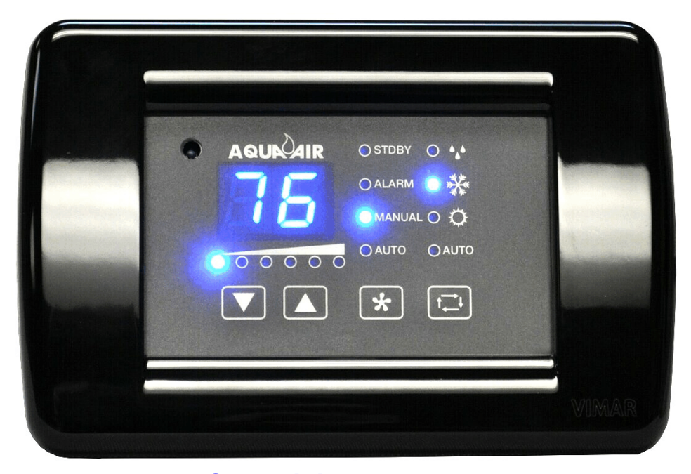
TSVW Digital Thermostat with Black Vimar Bezel Actual Size

Aqua-Air Manufacturing, division of the James D. Nall Co., Inc. 1050 East 9th Street, Hialeah, Florida 33010 U.S.A. Ph. 305-884-8363 Fax 305-883-8549 E-mail sales@aquaair.com